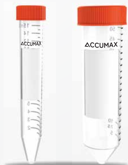
15 ml 17000 g