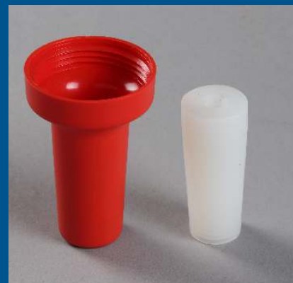
Silicon Pipette holder