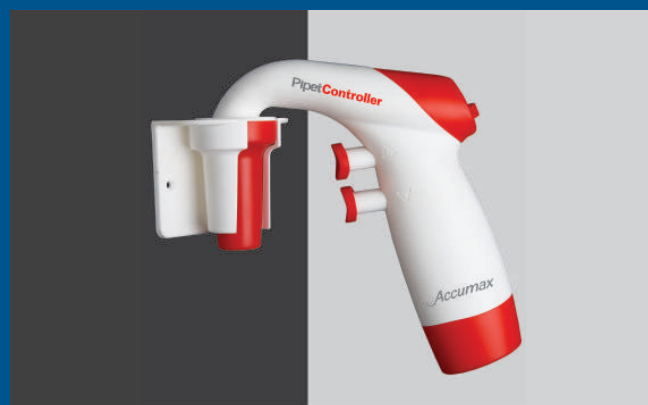
wall mounting stand