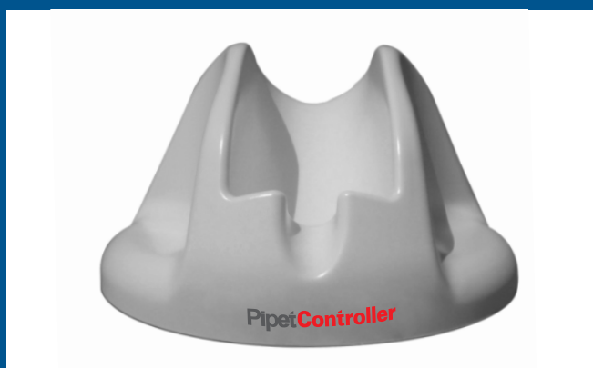
table top stand